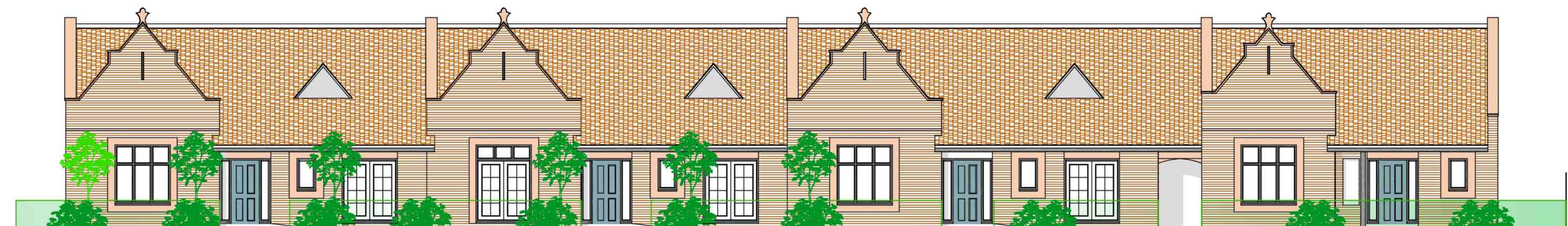
STREET SCENE - ELEVATION TO COURTYARD (SOUTH EAST) ELEVATION A