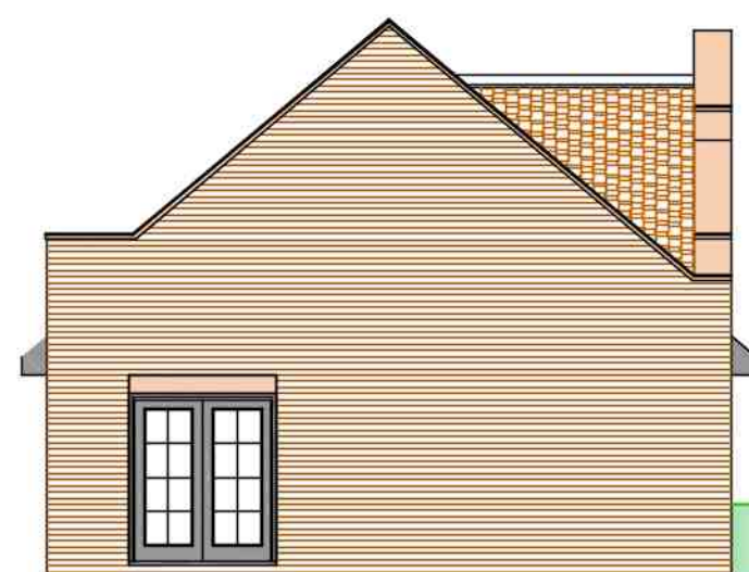
END ELEVATION (SOUTH) ELEVATION C