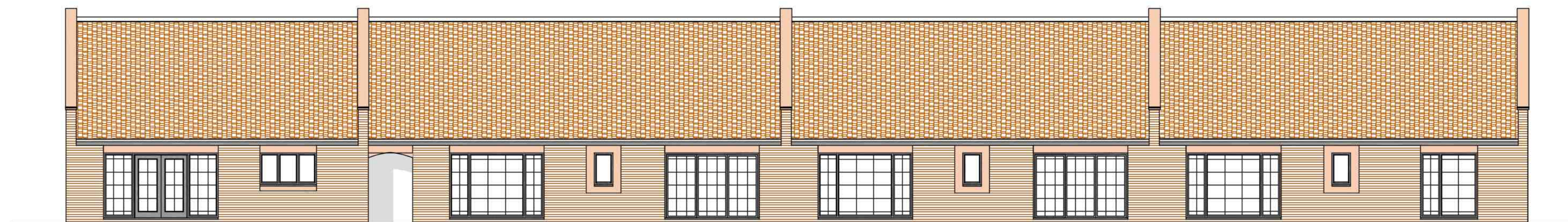
REAR ELEVATION (NORTH WEST)