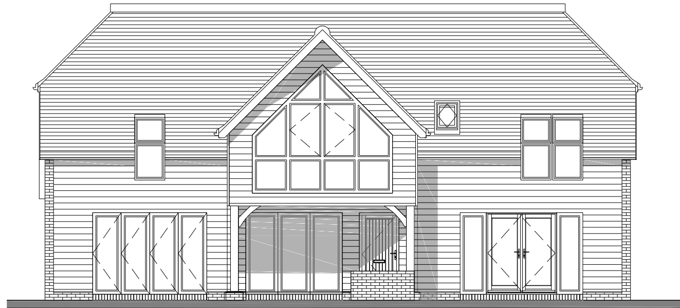
FRONT ELEVATION (south)