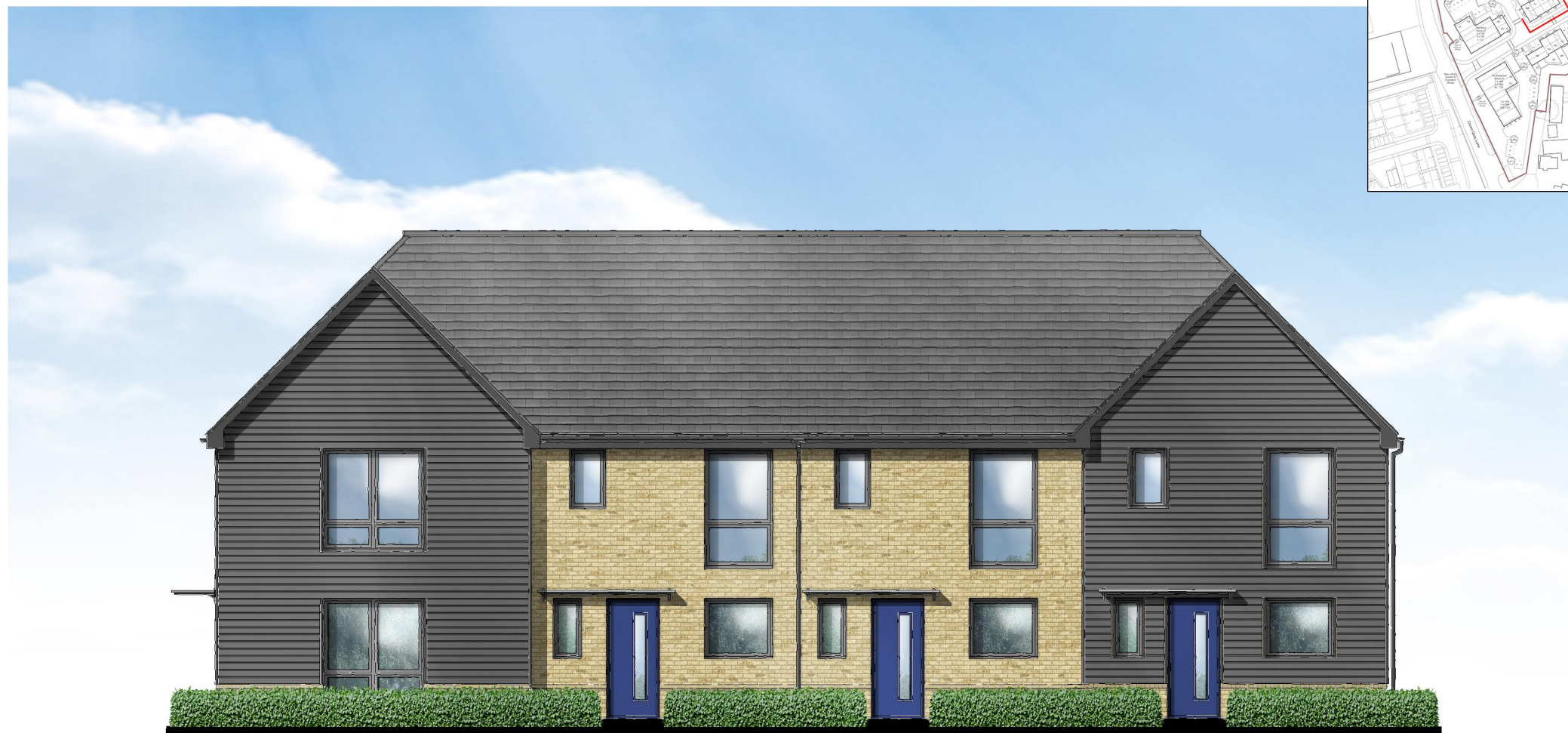
The Blemmere Plot 14