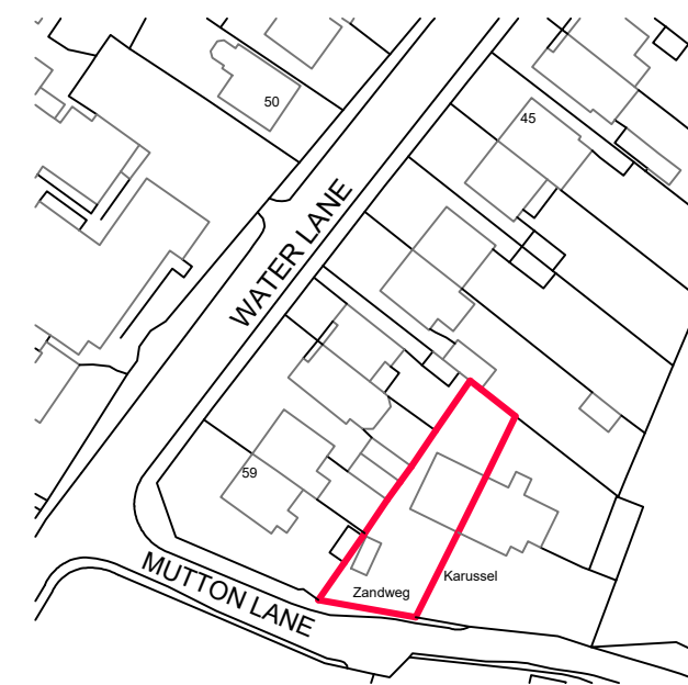
03 Site Location Plan Scale 1:1250