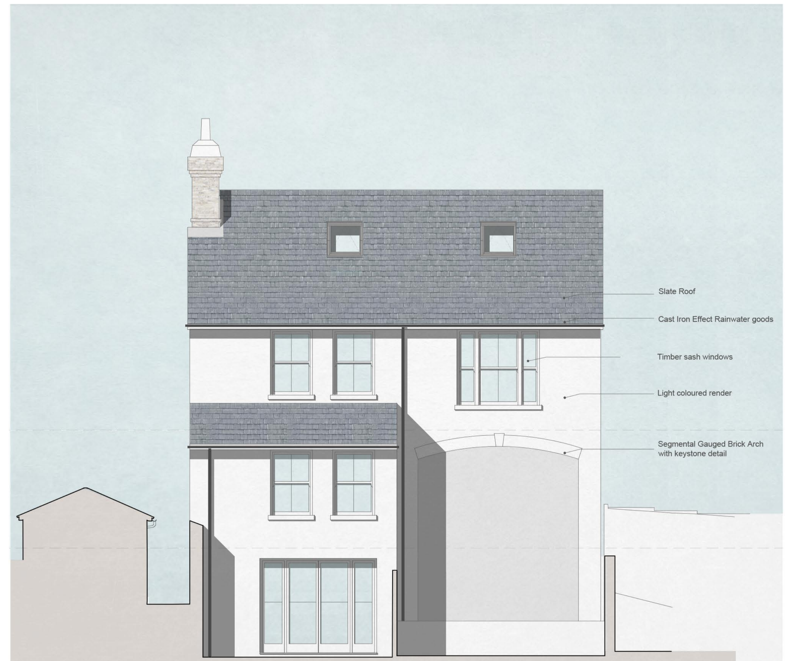
Rear Elevation (East) As Proposed - 1:50