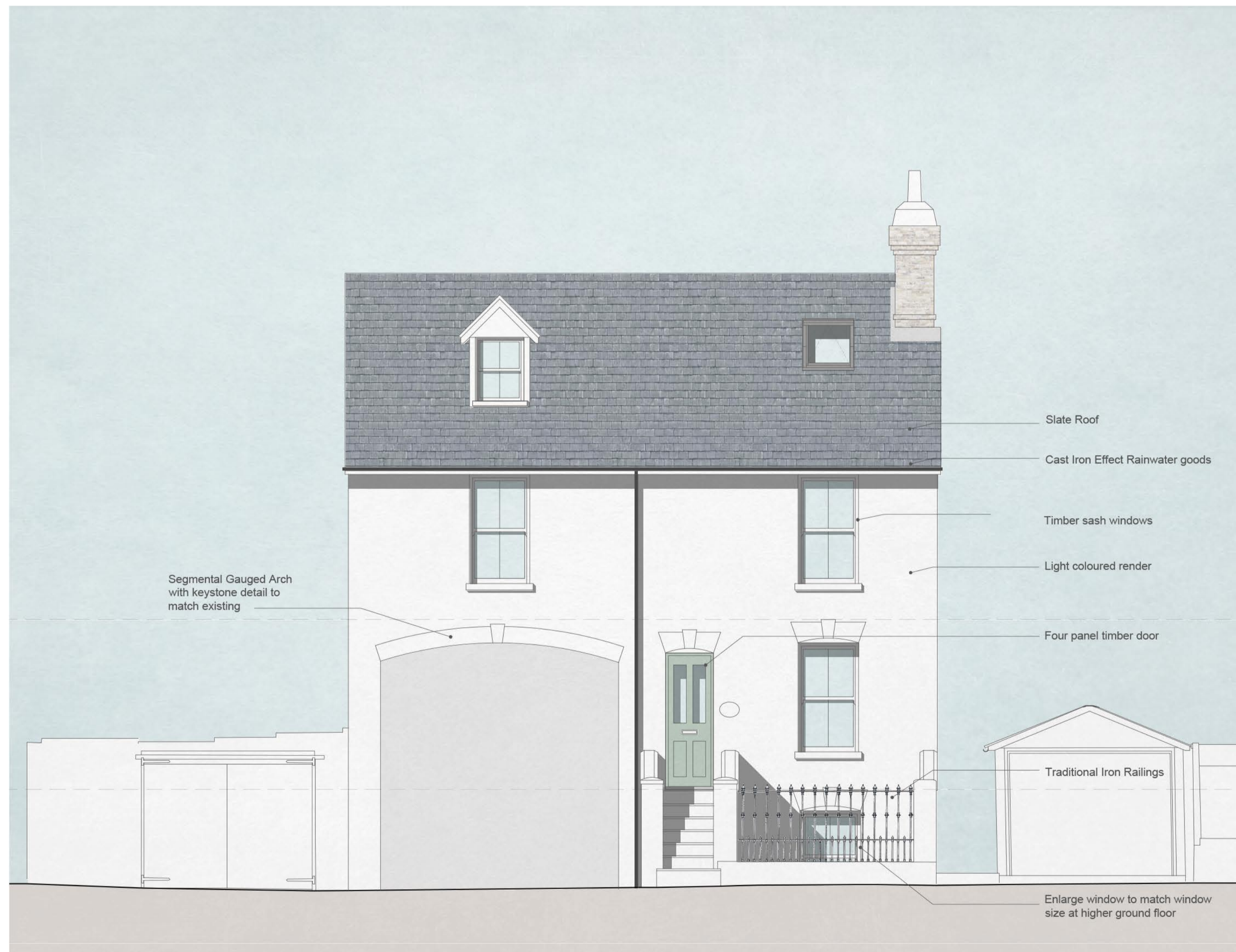
Front Elevation (West) As Proposed - 1:50