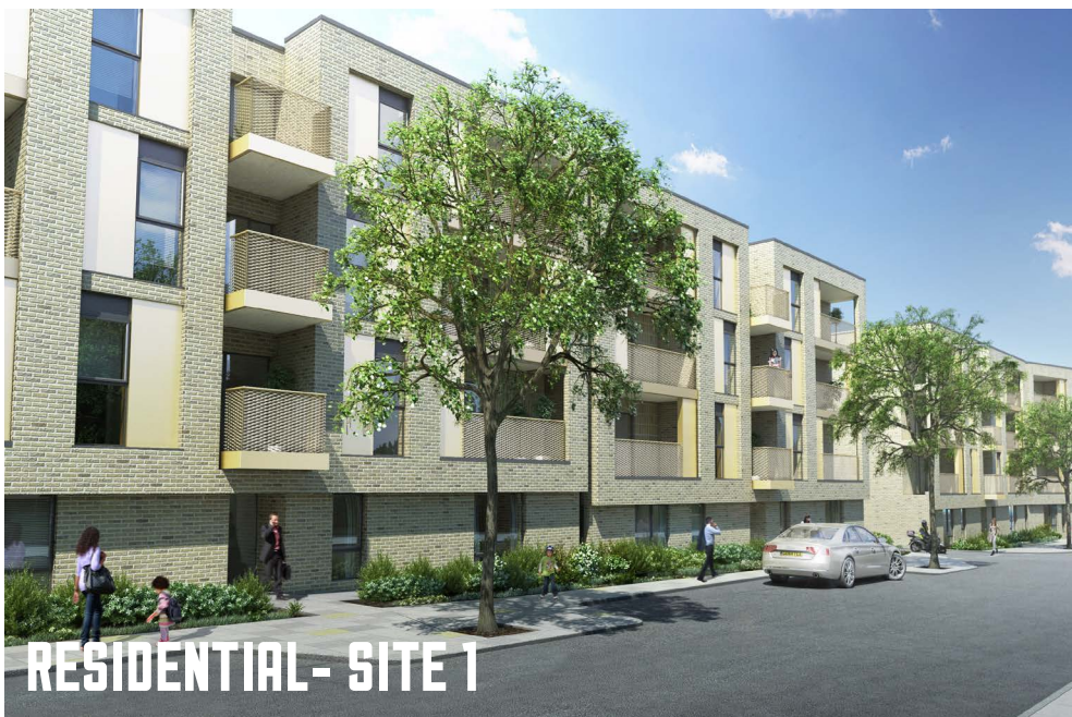
RESIDENTIAL- SITE 1