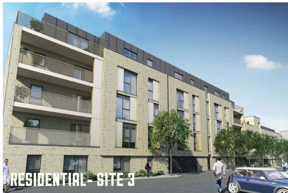
RESIDENTIAL- SITE 3