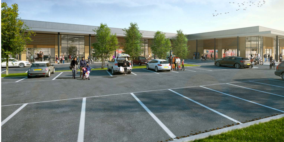
RETAIL UNITS 1-3